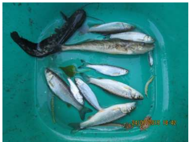
Photo 2. The main method of sampling used - Electric fishing and its species richness for one sample, quickly released alive in natural environment

Using two complementary fish sampling methods (gillnets fishing and electrofishing), more accentuated by main method of sampling for rivers - electrofishing, we found that fish fauna from Lower Mures River is very diversification, with a lot of fish species ( Photo 2 ).