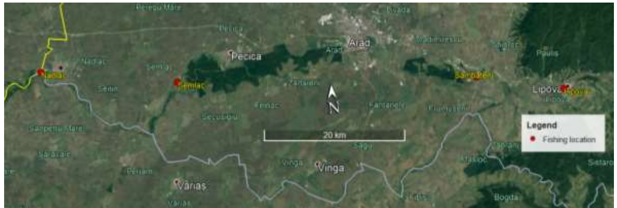
Figure 1. Location of the fish sampling sites from Lower Romanian Mures River in 2019

The physico-chemical parameters were found on the field using the HACH electronic multiparameter (HQd Field Case with 4 sensors for pH, Oximeter, thermometer and conductivity meter), the Secchi disc used for water depth and transparency, Van Veen grab sampler for the benthic substrate used with sieve, GPS for geographical coordinates, flowmeter FLO-MATE 2000 model for water current values ( Photo 1 ).